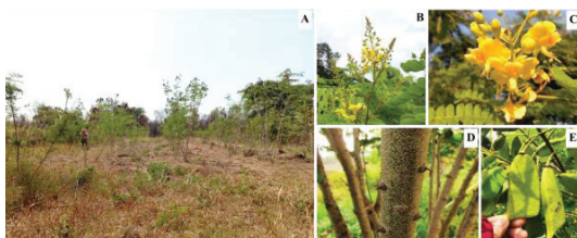
Figure 1. Cultivation of Caesalpinia sappan in the field (A), inflorescence (B), flower (C), stem (D) and pod (E) at three and a half years of age