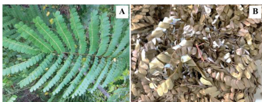
Figure 2. The characteristics of fresh (A) and dried (B) appearance of Caesalpinia sappan foliage